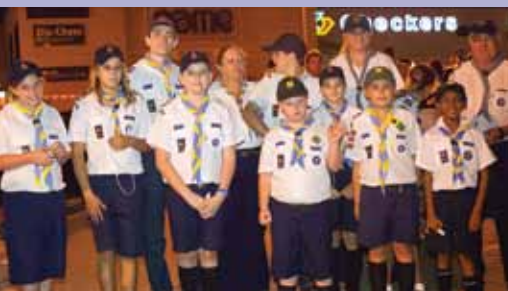
1st Richards Bay Sea scouts about to fill hundreds of Luminarie bags dedicated to cancer survivors.

1st Richards Bay Sea Scout Group took part in the 'Cancer Relay for Life' in Richards Bay in May at the Boardwalk Shopping centre. 1st Richards Bay were in charge of the LUMINARIE BAGS. They had to fill hundreds of paper bags with sand all dedicated to Cancer survivors and place them around the perimeter of the walk with a candle inside the bag. The candles were lit, lights switched off and a lap of honour was done by the cancer survivors in memory of loved ones passed away. These bags were all decorated with paint and pictures of loved ones and it was a very moving ceremony. The 1st Richards Bay Scouts were congratulated on a job well done. In total R139 000 was raised for Cancer at the Relay.